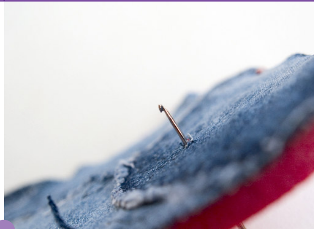
11. Use small crochet hook and push it from bottom shoe to the top, so you could grab your "twisted sewn scrap hook". (Next picture).