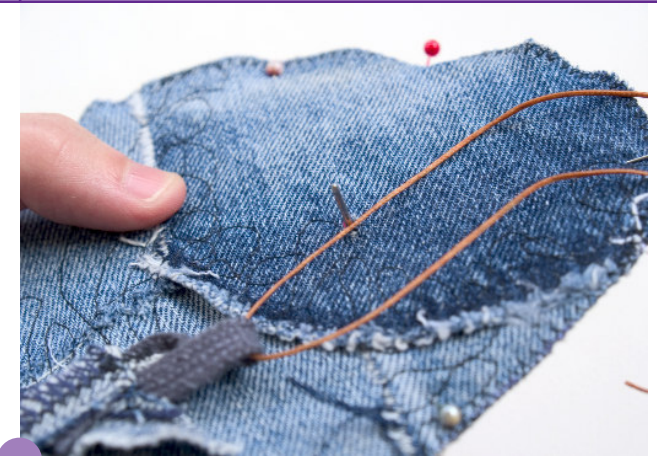
12. Use strong string and put it through the twisted loop.