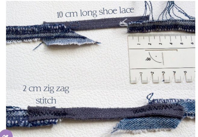
09. Cut 10 cm long shoe lace and sew it on both edges with 2 cm on a seam scraps jeans with zig zag stitch.