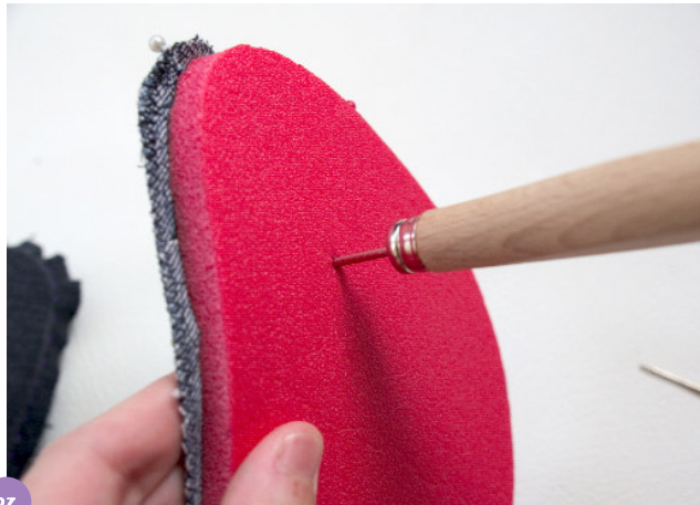
07. With awl make a hole between first two fingers.