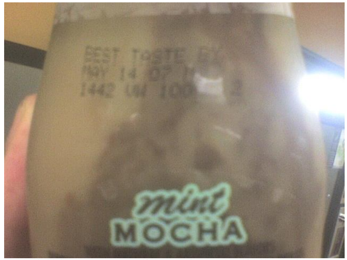
Note that the label says "Best Taste By" and it doesn't say it's currently undrinkable (a year later...)