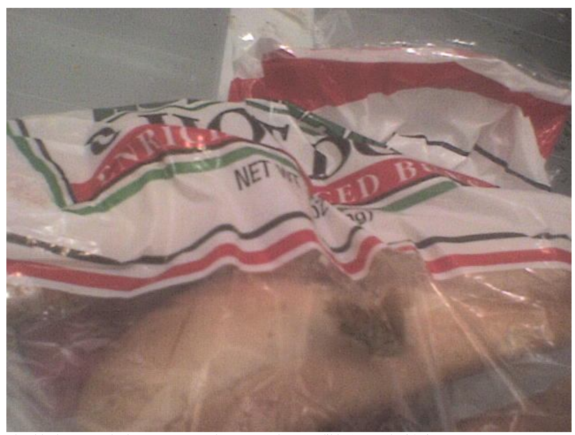
That black spot on the buns may mean these are no longer edible (or maybe it's just me...)