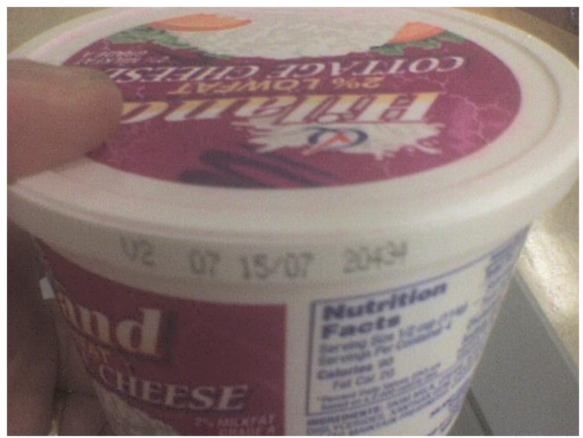
Hey, less than a year out of date!