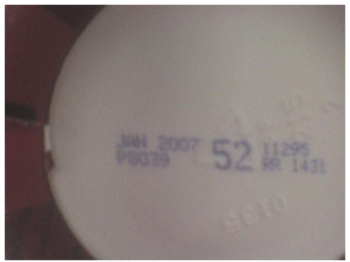
There's no date, so I'm not sure if this is the oldest or not...