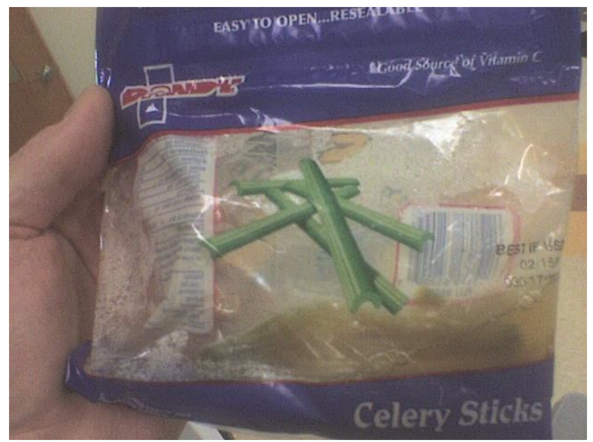
I'm sure these weren't originally packed in brown water...