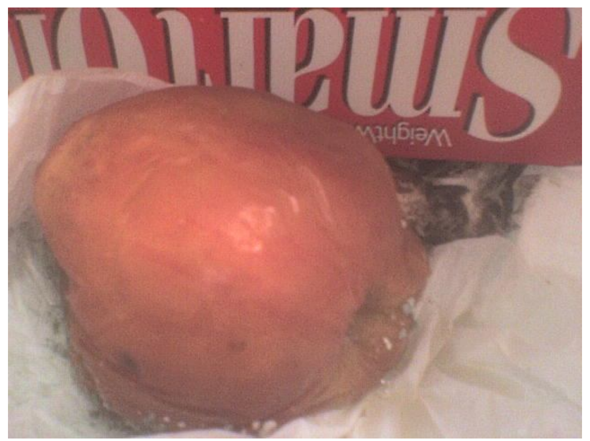
It may be difficult to tell, but this apple looked like it was deflating. The bottom was flat.