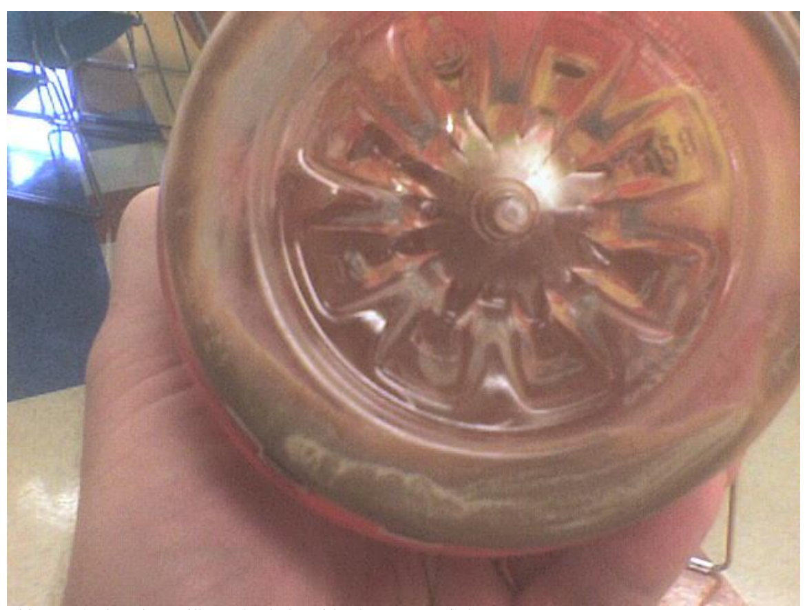
This wasn't chocolate milk, so the dark residue has me worried.