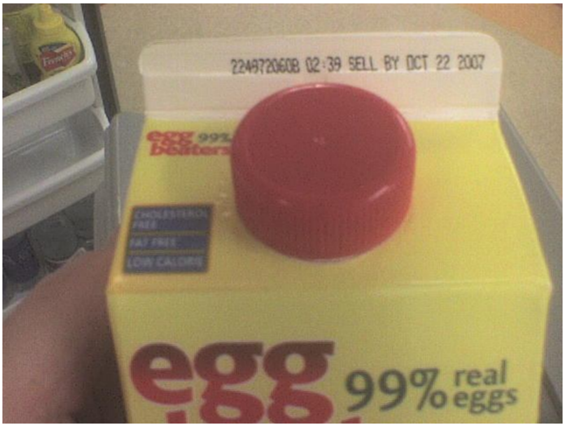
Who has egg beaters at work? (for their coffee?)