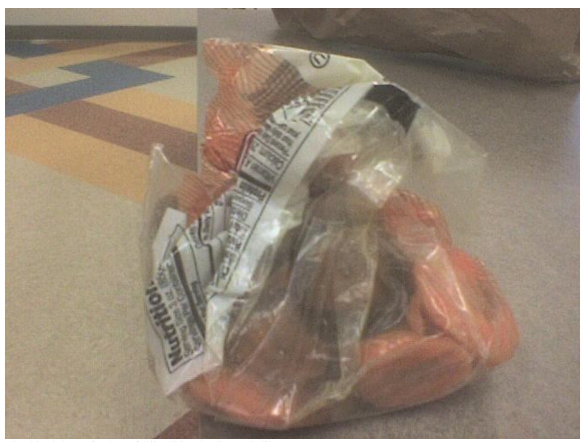
The black lump in the middle didn't look much like a carrot.