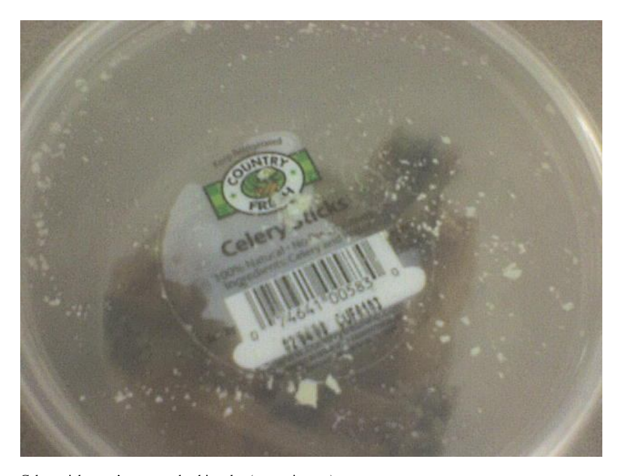
Celery sticks aren't meant to be this color (or consistency)