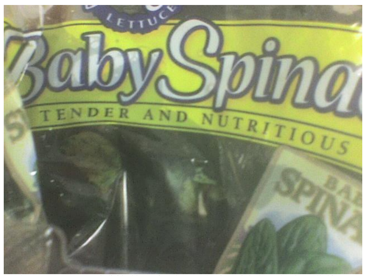
No, the reason you can't see individual leaves isn't because the picture is bad. It's that they gelled into a single mass of deep green.