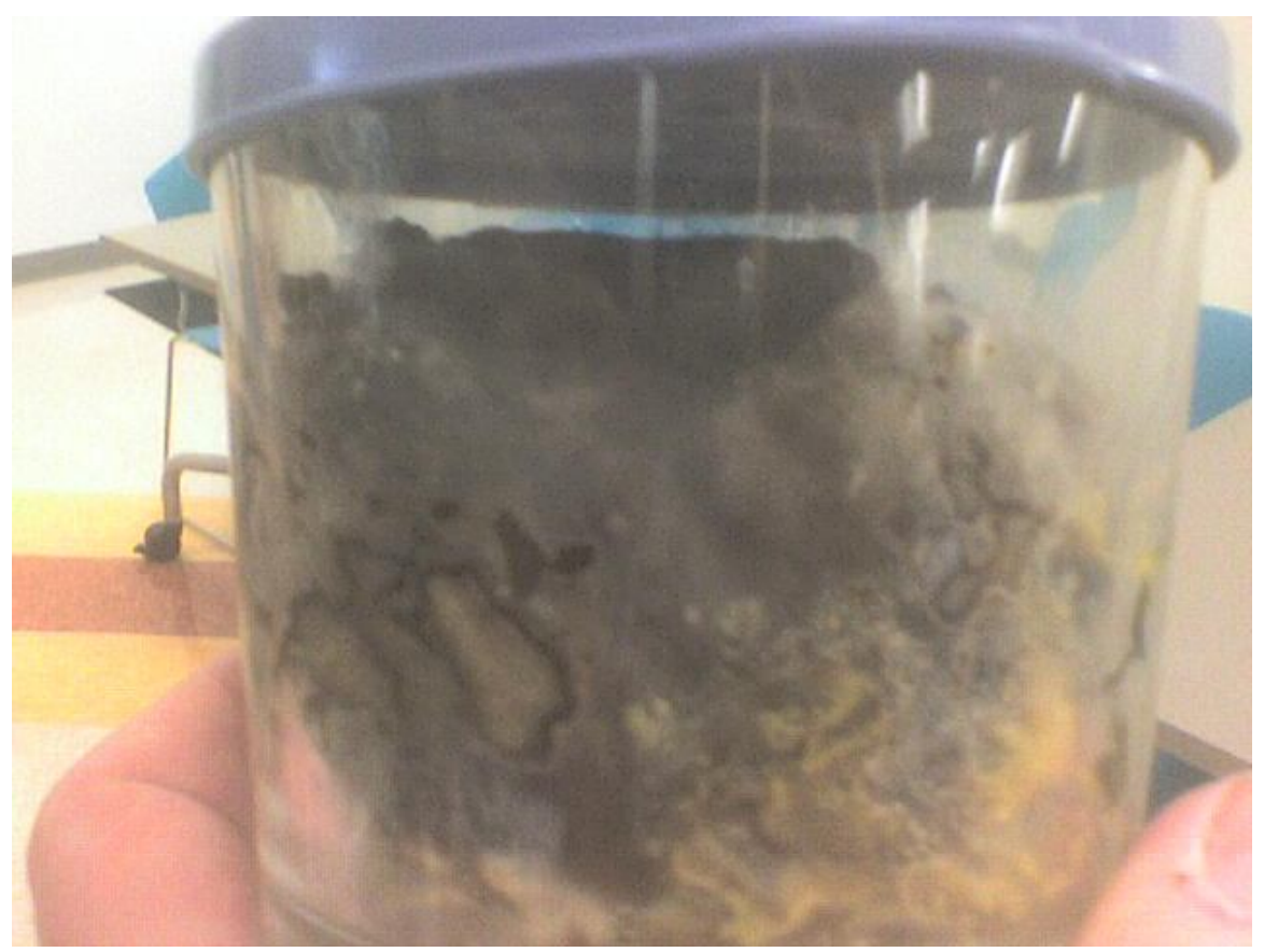
Not sure where to begin with this one...