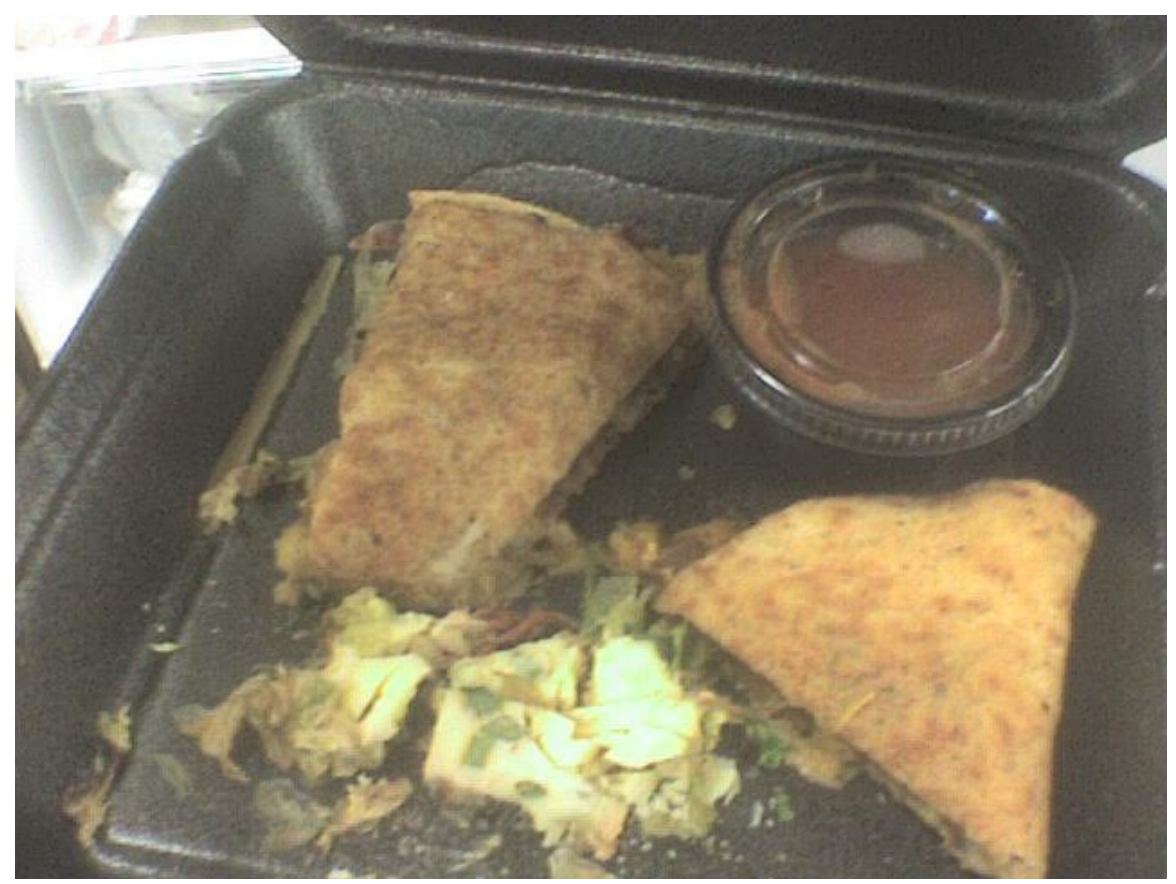
What do you think the original color of the sauce was?