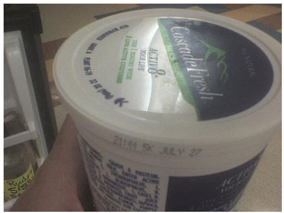
I'm pretty sure it isn't July of 08, especially since it sounded a bit 'sloshy'