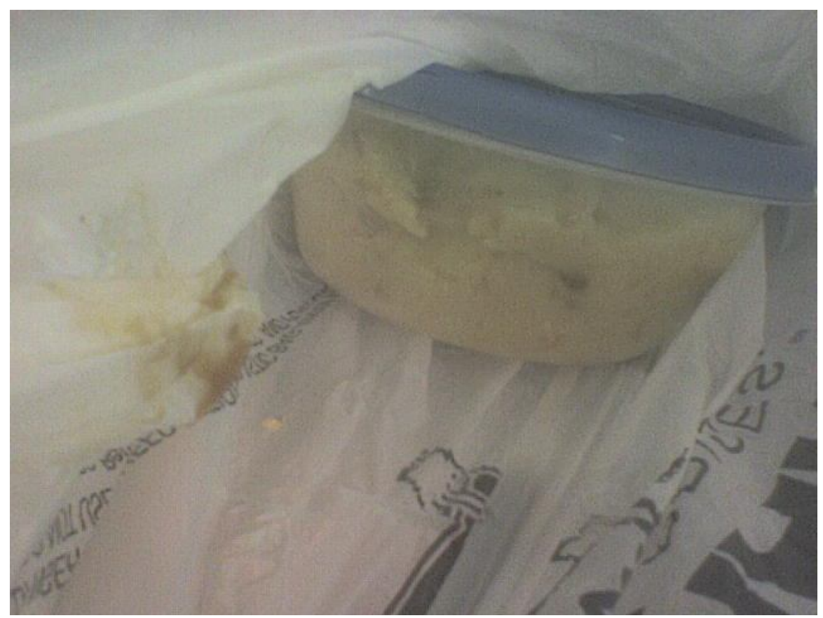
It's hard to say what this once was....