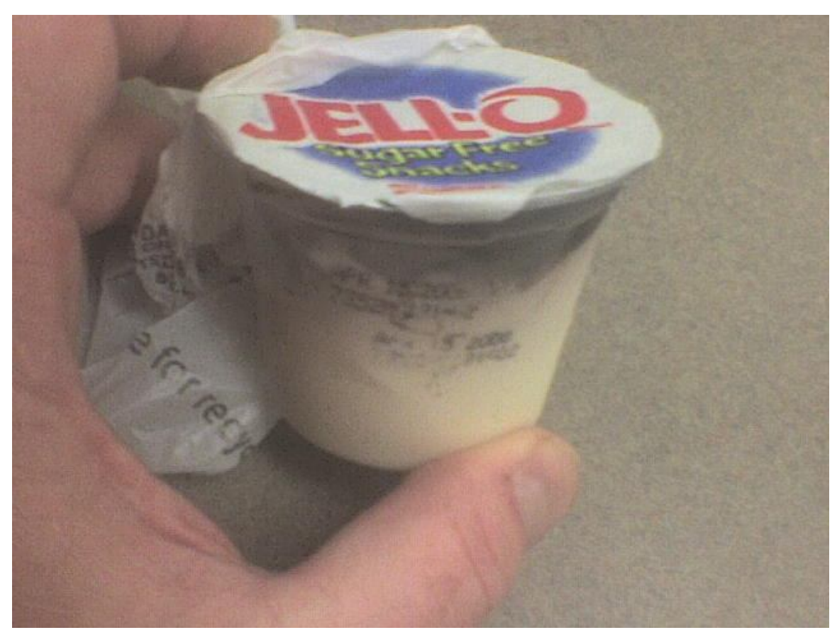
Jello isn't typically black...