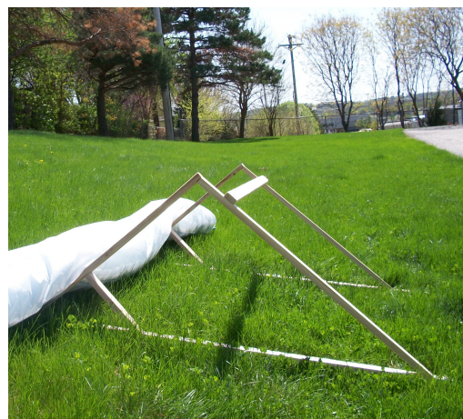
Brace holding Cofferdam